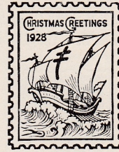
The gallant Ship "Argosy"

Printer's marks on sheets: Eureka has no mark but can be identified by the Perf. 12. E. & D. has red dot to left of knee of first reindeer on seal No. 92. U. S. P. & Litho. Co. has two red dots in white gutter, one at lower left of seal No. 46 (and sometimes No. 41) and the other at upper right of seal No. 55. The perforations often strike out one of these dots.