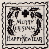
CS1 (Type II)

SEALS ISSUED AND SOLD BY THE DELAWARE CHAPTER OF THE AMERICAN NATIONAL RED CROSS.