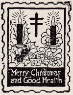
CS19 (Type I)

32 CS18 One type only .05 Lithographed by The Strobridge Lithographing Co.; Edwards & Deutsch Lithographing Co., Chicago, Ill., and The United States Printing & Lithograph Co., Brooklyn, N. Y.