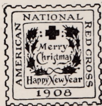
CS2 (Type II)

SEALS ISSUED AND SOLD BY THE AMERICAN NATIONAL RED CROSS.