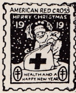
CS13 (Type II)

Type II booklet panes are the same but have a perforated margin at top and stub attached. These will be difficult to plate as makeup of sheet is not known. One or both vertical margins are rouletted on Number 22c; perforated on Numbers 22f and 22h and Number 22i is rouletted 12½ on left perforated 12½ on right. Numbers 22j and 22k are booklet panes of 10 seals arranged 5x2.