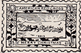
CS7 (Type I)

10 CS6 One type only 1.00 Lithographed by The Strobridge Lithographing Co.