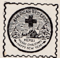
"The Old Home Among the Cedars"

SEALS ISSUED BY THE AMERICAN NATIONAL RED CROSS BUT SOLD BY THE NATIONAL ASSOCIATION FOR THE STUDY AND PREVENTION OF TUBERCULOSIS.