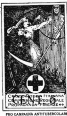
Italy Italian Red Cross, 1916

Island —Christmas seals have been sold there for the care of sick children including those with tuberculosis, and among them will be found some of the most artistic designs of any of the Christmas seals used.