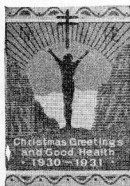
Japan White Cross Society, 1930

Portugal —has sold seals through its national tuberculosis association continuously since 1927 but the government also issued semi-postage tuberculosis stamps as early as 1904 for the benefit of the National Aid Society for Consumptives. As is done in several other countries, the seals here are printed in a given year with the same design but in different colors. For example, the 1929 seal appears in light blue, purple, green, brown, and in several other shades.