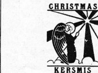
South Africa, 1931

Norway —Like the other Scandinavian countries, Norway has attractive designs that picture various domestic and symbolic scenes. The 1928 seal