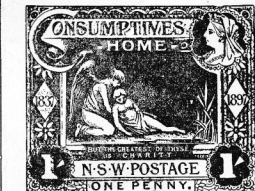
New South Wales, 1897

tinuously since 1913 with the exception of one year, 1917. The Japanese National Association has sold seals since 1925. The French Comite Nationale began its seal sale in that same year.