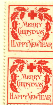
Vert. Pair Imperf. Between