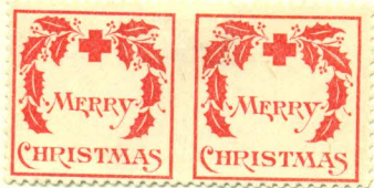
Horiz. Pair Imperf. Between